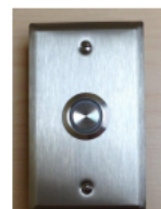
Image below is unfortunately only available in Swedish since it is a new installation guide for the external switch that is still under work but.

Since it is a 3 rd part system we can't provide with detailed instruction more than that of how the switch functions works.